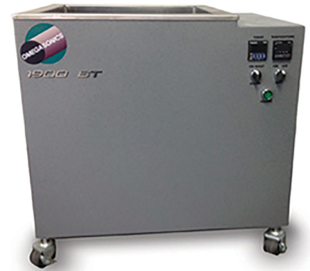
Omegasonics 1900 BT

The Omegasonics 1900 BT is a 28 gallon (106 liters) capacity tank. Typical water level height is 6 inches (15.2 cm) from the top of the tank lip, which provides 20 fluid gallons (75.7 liters); therefore, 2 bottles of WaterWorks should be used to charge the tank.