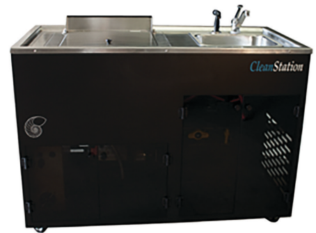
CleanStation SRS II

NOTE The SCA-1200 can use either WaterWorks concentrate or Ecoworks packets. When using Ecoworks, the entire contents from 4 packets (2 A packets and 2 B packets) should be added to the tank. See “SCA-1200” on page 16 for details.