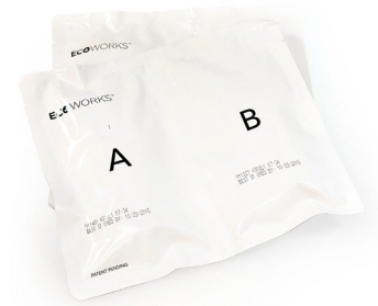
Packets (for use with WaveWash)