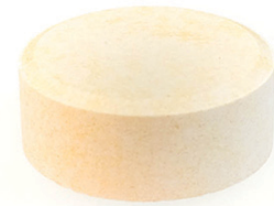
Tablets (for use with WaveWash 55)

The WaveWash system is used in conjunction with Ecoworks packets. These packets consist of two pre-measured dissolvable pouches (labeled A and B) which are placed into the WaveWash tank. Once exposed to water within the tank, these packets mix together to form the solution used to remove support material. One set of packets treats one WaveWash tank, or 3.6 gallons (13.5 liters) of water.