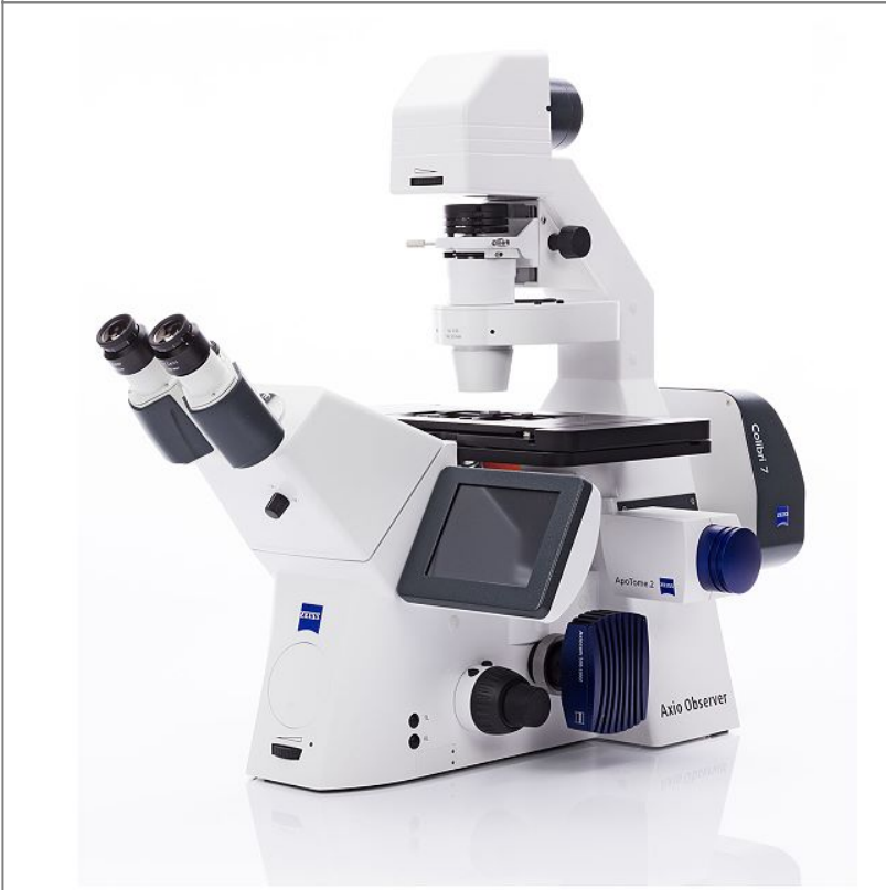
Zeiss Axio Observer 7